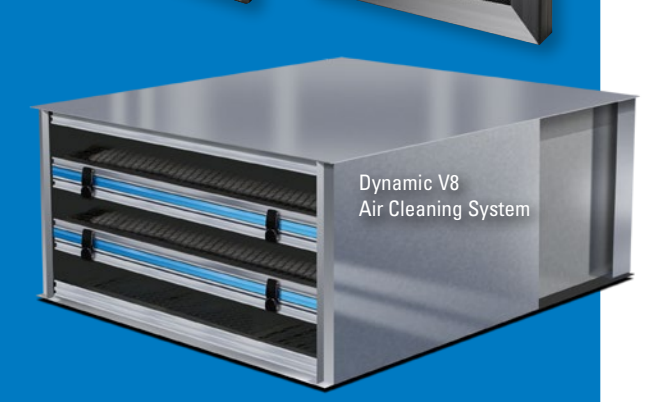
Dynamic Air Cleaning Systems can be configured to provide the absolute best possible air cleaning solution for your application.

If you are interested in removing airborne pathogens and providing the best possible air quality to students and staff, AND reduce maintenance requirements, then visit our website at www.DynamicAQS.com. You'll find